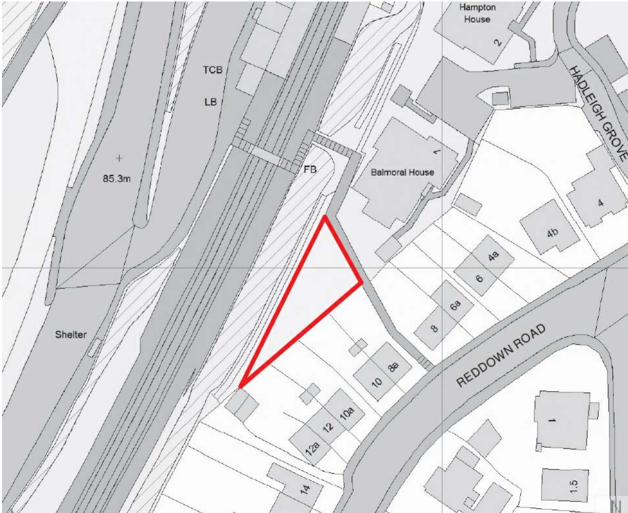
Fig 1: Site location plan