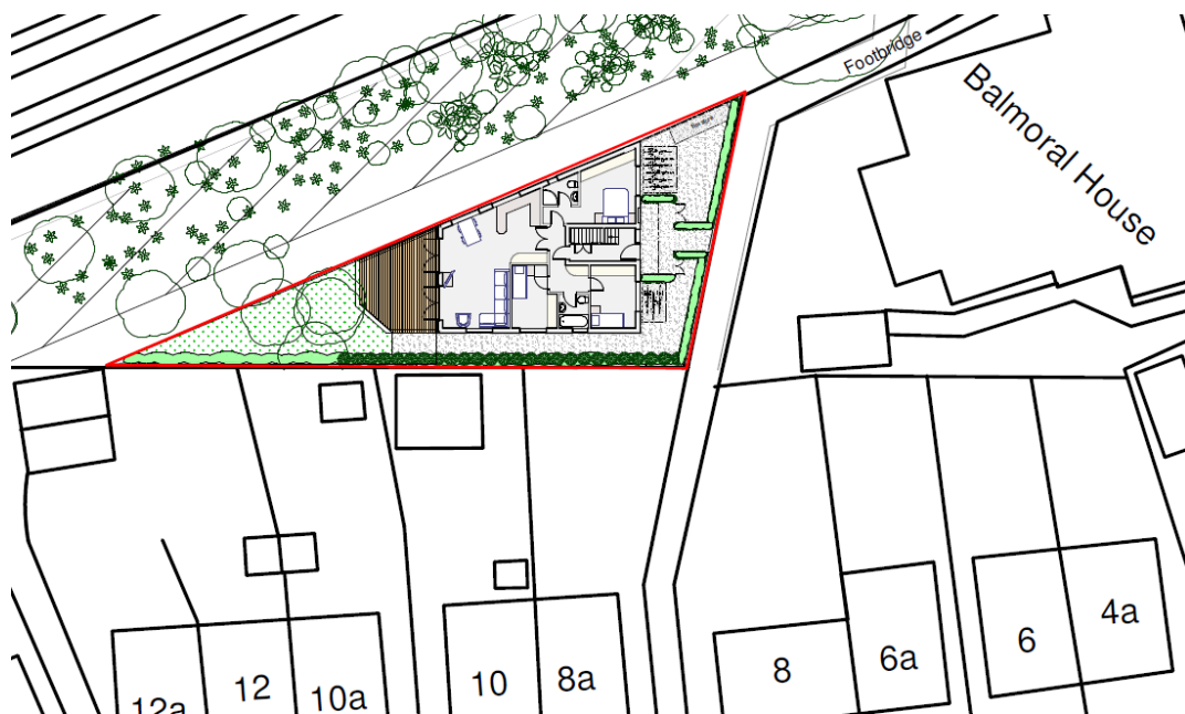
Figure 3 – Indicative site layout plan showing relationship with adjacent properties

8.6 The illustrative scheme demonstrates that a development could be constructed without harming the amenity of any adjacent residential property.