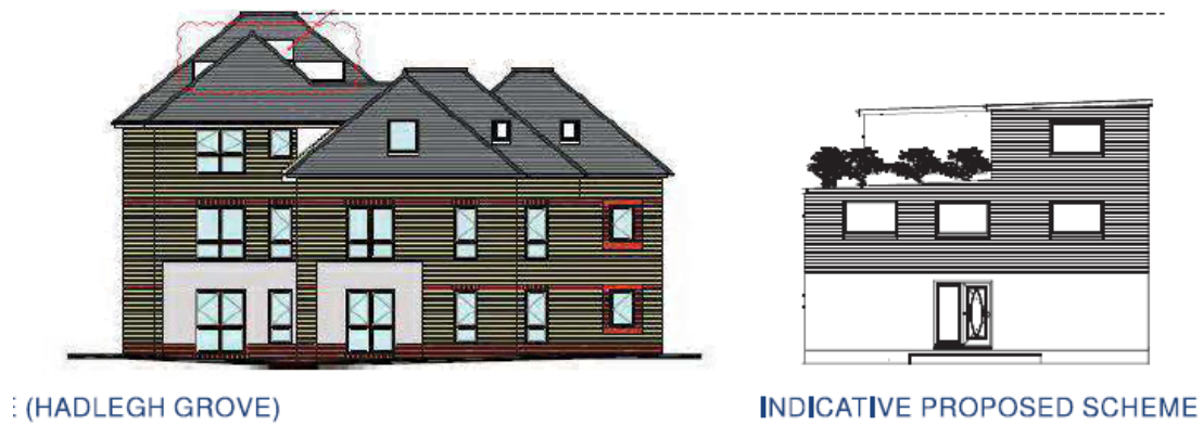
Figure 2 – Indicative levels and relationship with adjacent properties

8.5 The illustrative scheme is not for determination.